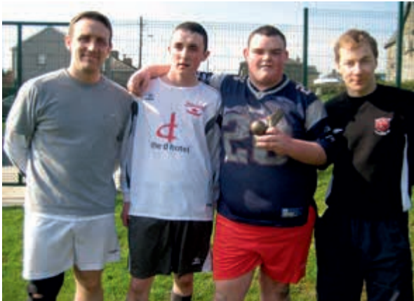
Top left: Monaghan Youthreach Team; Top Right: Drogheda Youthreach Team;